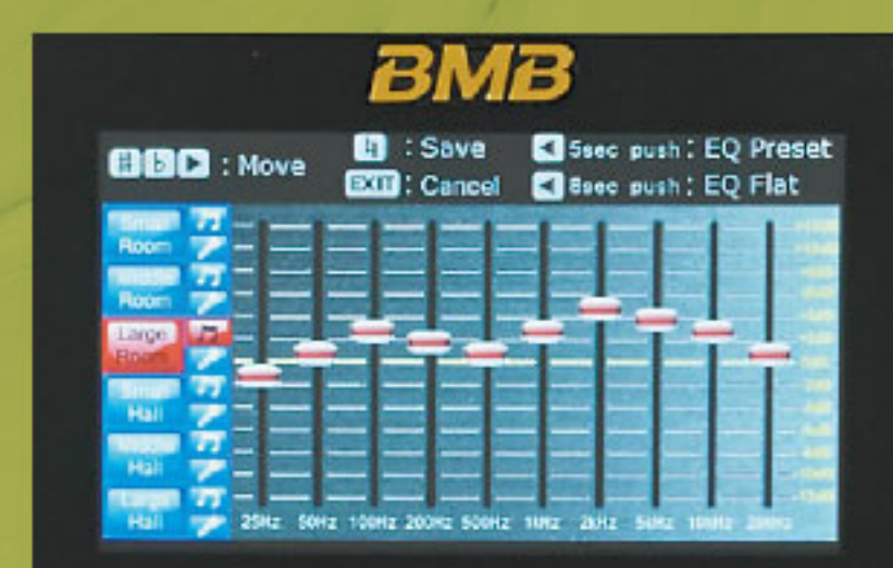
10 bands Equalizer