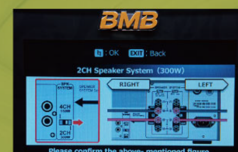
How to connect