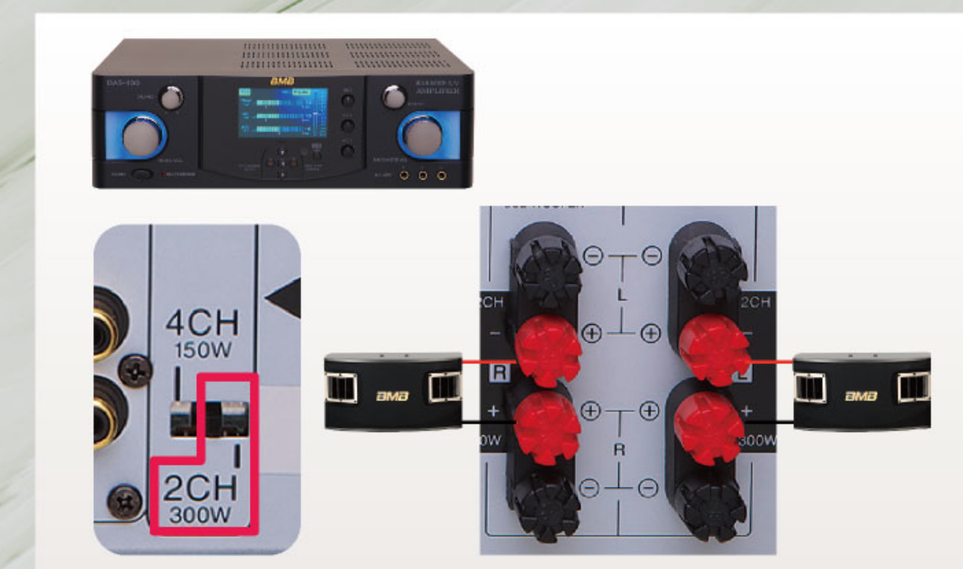
How to connect (300Wx2CH Mode)