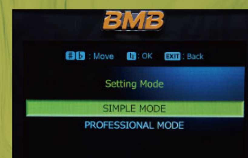
Simple / Professional mode