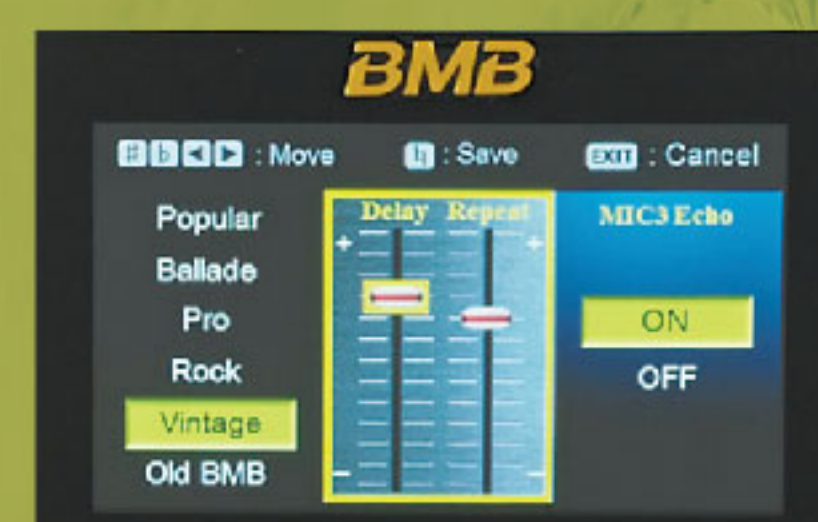
6 types Echo