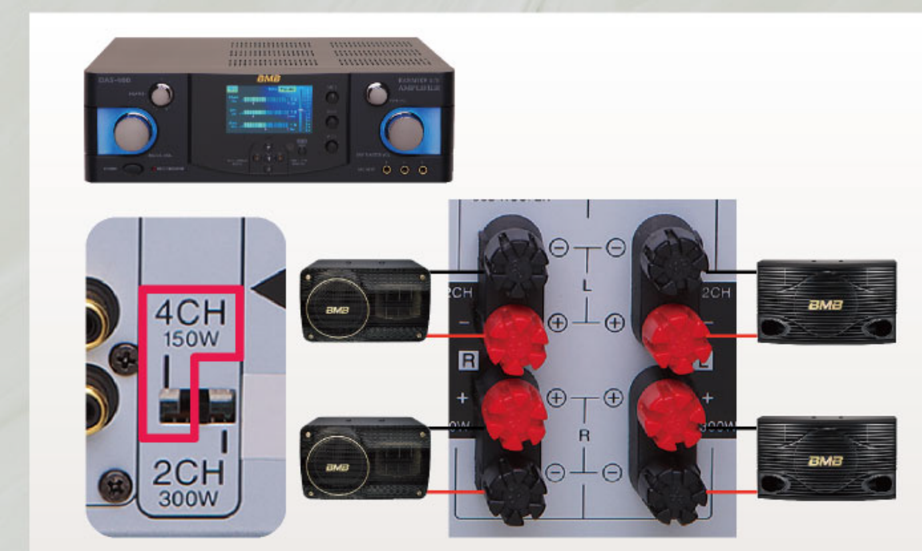
How to connect (150Wx4CH Mode)